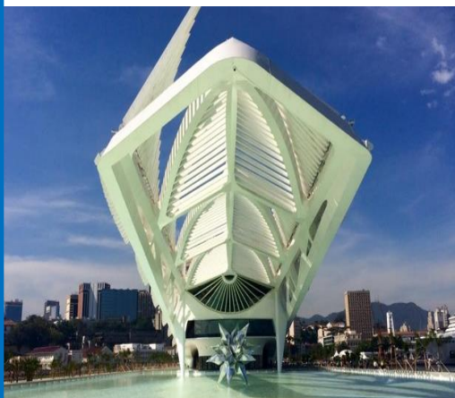
Museum of Tomorrow

How to get there? You can take the ferry, that stops at square fifteen (Praça XV). From there to the museum, it takes 20 minutes on foot, but you can also take a bus (about 20 bus lines connect square XV to Mauá square).