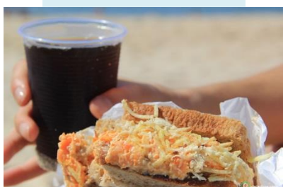
Sandwich and matte tea