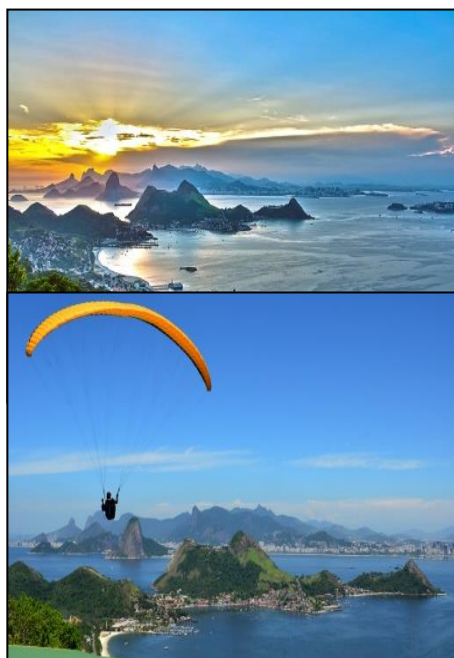
Parque da Cidade

The sunset in Parque da cidade is breathtaking, it's totally worth it to be there by this time.