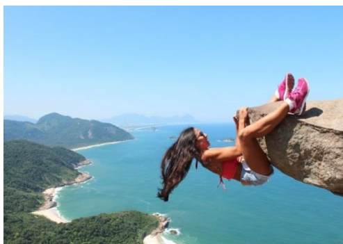
Pedra da Gávea

To minimize the risks of accidents, it is highly recommended to get support from a guide. At the end of the trail, there is escalada da carrasqueira , a wall with approximately 30 meters high, considered the critical point of the hike. The rock stays within Tijuca National Park.