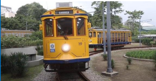
Santa Teresa Tram

The tram line was out of order for 4 years, and was reactivated in 2015. Now, they are operating in two lines: Largo da Carioca- Largo do Guimarões, and Largo da Carioca-Francisco Muratori. The trains leave every 20 minutes from Guimarões, and every hour from Muratori. It costs 20 brazilian reais the round trip.