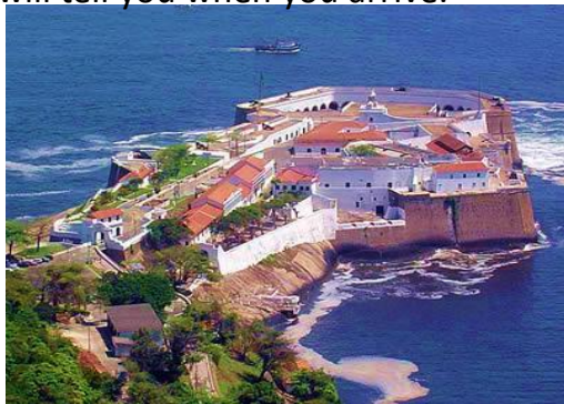
Santa Cruz da Barra Fortress

How to get there: in Icaraí beach, take any bus with Jurujuba as a destination, and show the bus driver where you want to go, he will tell you when you arrive.