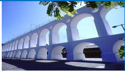
Arcos da Lapa

The old Aqueduct of Carioca, also known as Arches of Lapa, is a postcard scenario in Rio. It is also a symbol of Old Rio, preserved in the bohemian neighbourhood of Lapa.