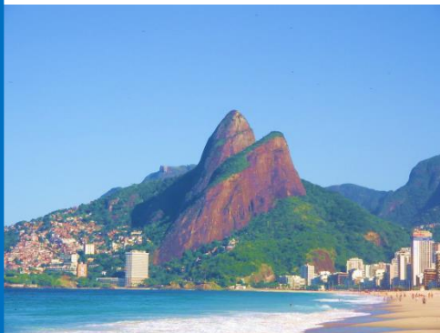
Morro Dois Irmãos

Alternative means of transportation, such as SUVs and motorcycle taxis are available at Vidigal's entrance, and can also take you there.