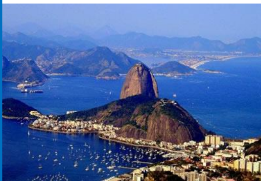
Urca Hill and SugarLoaf

The track that takes you up to the top of Urca hill is about 1,5km long. It alternates between steep ascents and plane segments. It takes about 40 minutes on foot to be rewarded with a gorgeous Guanabara bay view. The hike starts in Claudio Coutinho walking path, on the left corner of praia vermelha (the red beach). Through this way, you reach a cable car terminal, where you can buy a ticket to go up to SugarLoaf, or down to the praia vermelha (red beach) again.