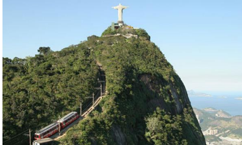
Morro do Corcovado

The start point is in Parque Lage , surrounded by birds, butterflies and little monkeys. It is a two-hour way up, and it is recommended to have a guide with you, since the hike is considered difficult. Still in the beginning of the trail, there are some waterfalls, perfect for a quick refresh. The area stays within Tijuca National Park.