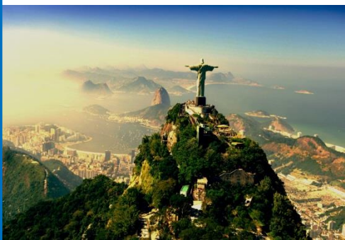
Christ the Redeemer

Attention: Be careful with SUVs that offer tickets and transport. Only close deals with authorized travel agencies.